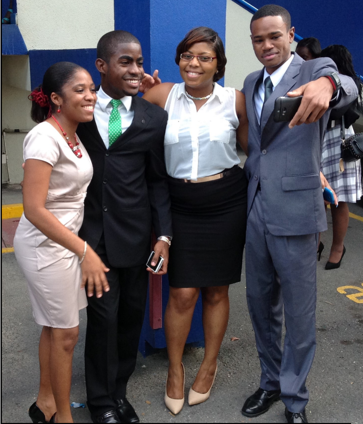
What's a meeting without a SELFIE?